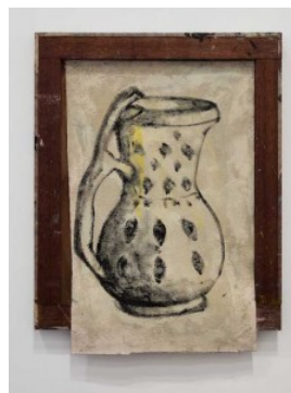
4 Patrick Hartigan, Late Harvest , 2016.