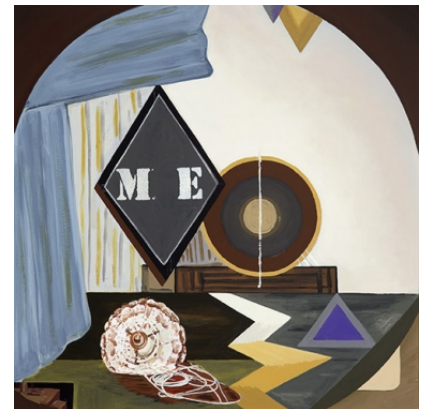
Diena Georgetti, The humanity of abstract painting , 2006. Acrylic on board with collage. Monash University Collection, Melbourne.