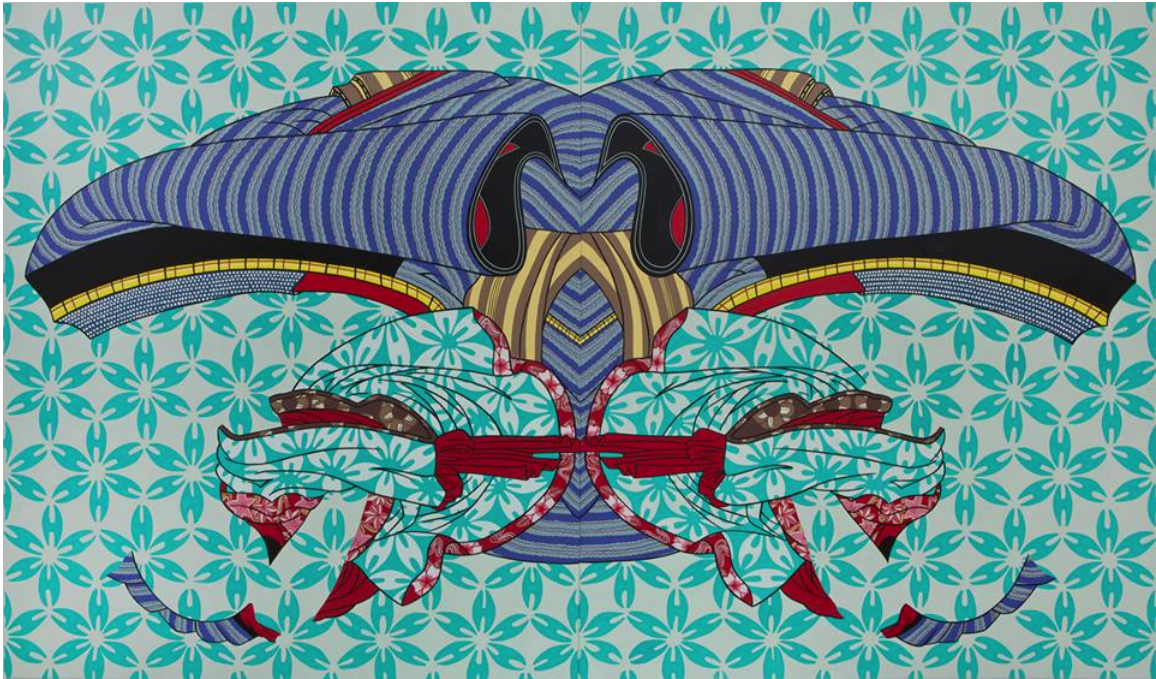
Natalya Hughes, Looking Cute, 2013, acrylic on plywood, 140 x 240 cm

delicate woodblocks. Resulting works such as Looking cute 2013 draw the viewer in with suggestions of imagined figures – not necessarily human, but perhaps arthropod or even alien.