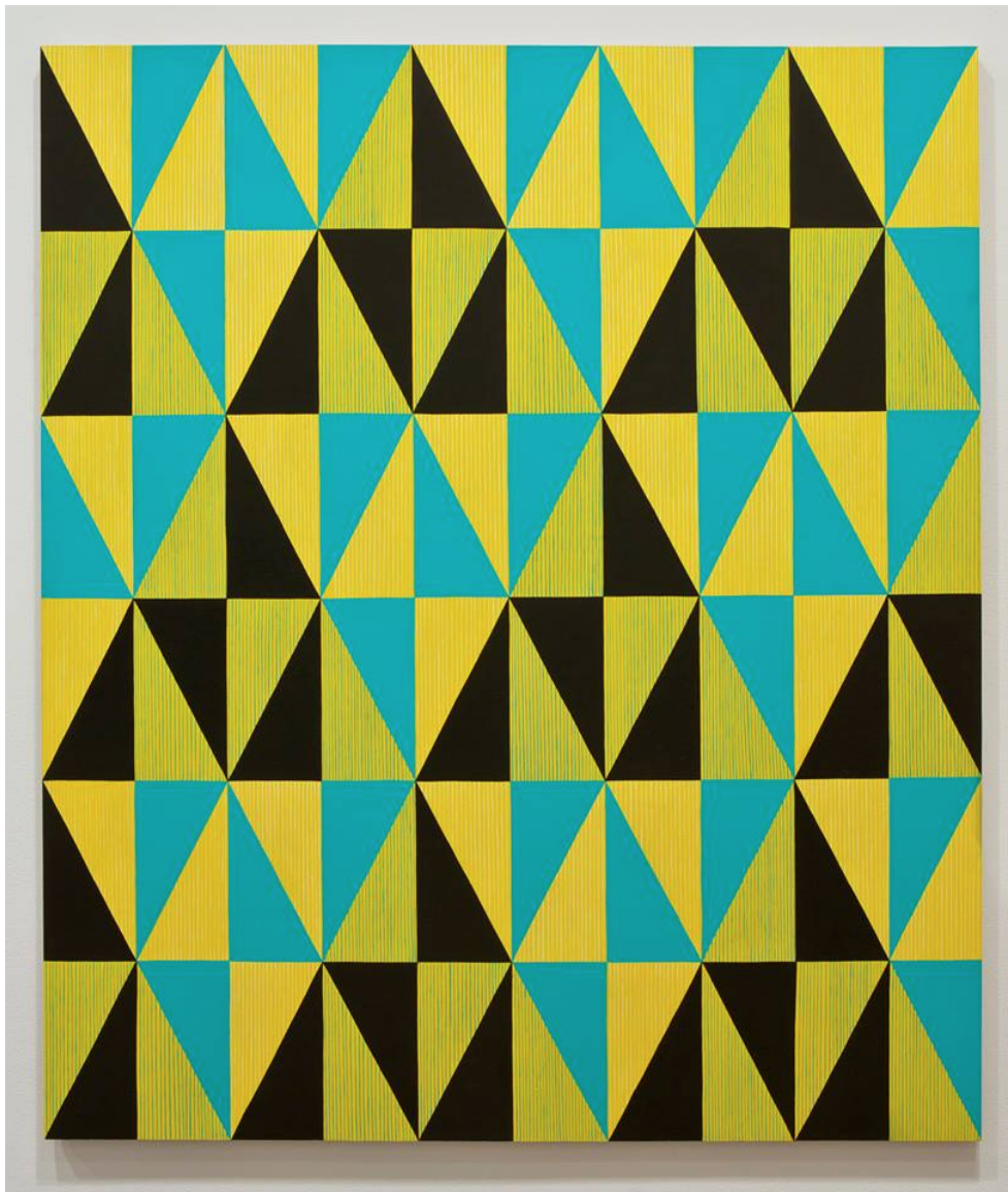
Natalya Hughes, Abstract, 2013, acrylic on plywood, 120 x 104cm

Abstract 2013 contains a percussive repetition of triangles, the geometry of which deliberately resists the narrative-charged readings of the other three paintings in the show. However the acid yellows and greens of this work harmonise with the other paintings in the exhibition while resonating with Western modernist traditions, and ultimately this small but rigorous exhibition is all the better for its inclusion.